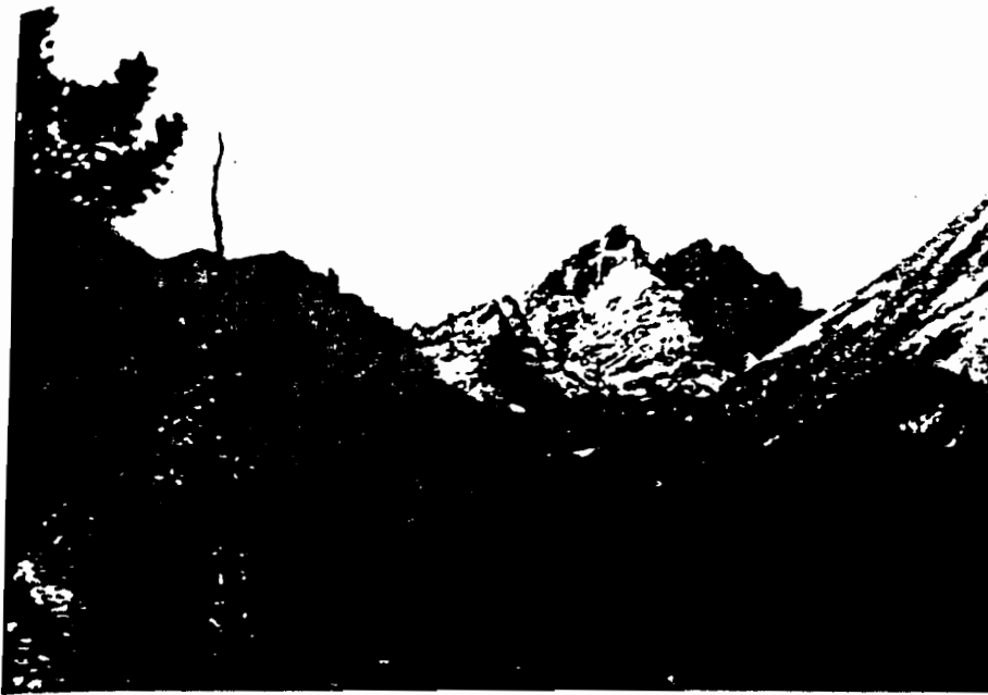
The Rocky Mountains look tall and striking to initiates, but foreigners who have grown up with a different landscape may have another view. Crestone Peak, San Isabel National Forest, Colorado.

scenery, but the general effect is a flattened one.